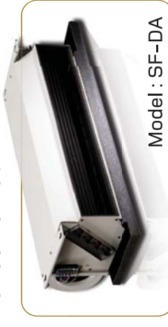
Model : SF-DA