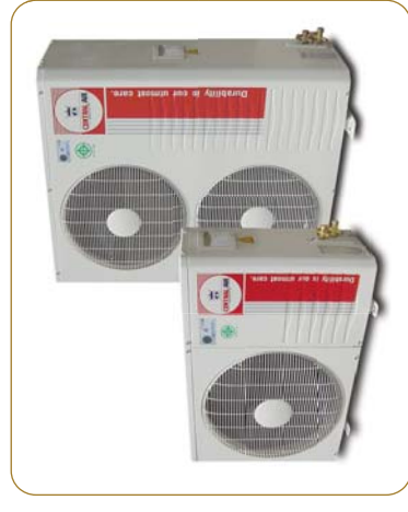
Condensing Unit :